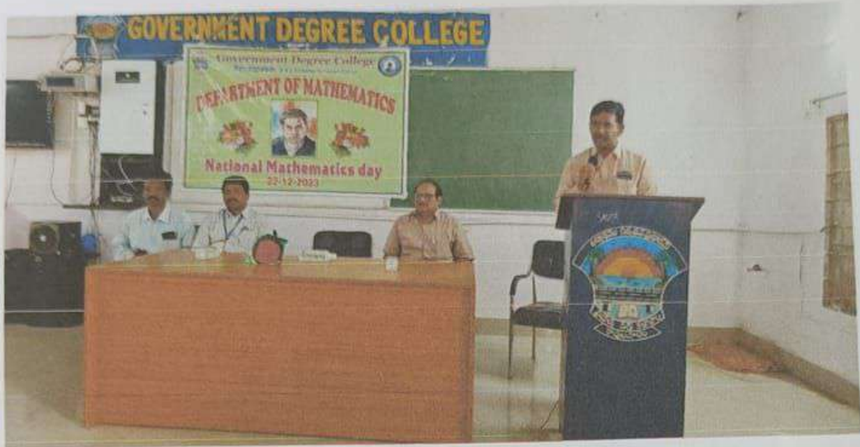
Opening Remarks by the Principal