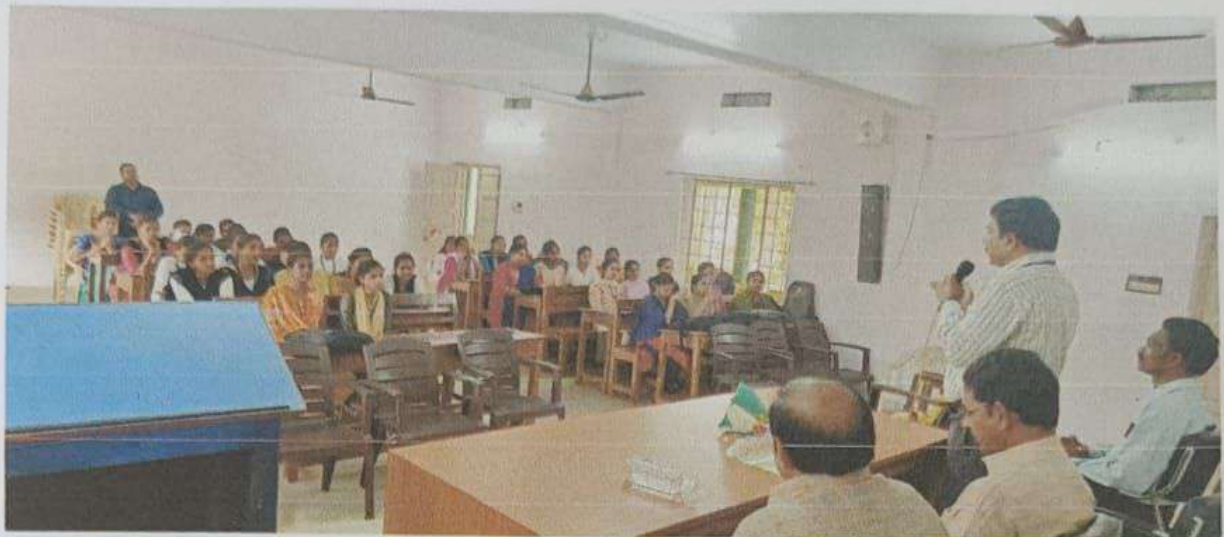
Address by the Internship Coordinator