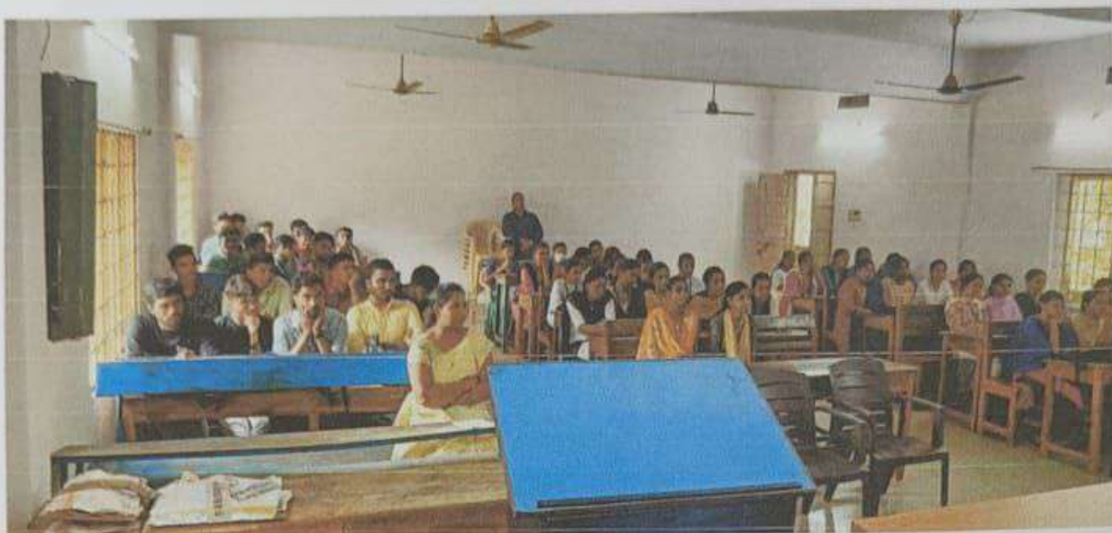
Attended Students in MANA TV Room