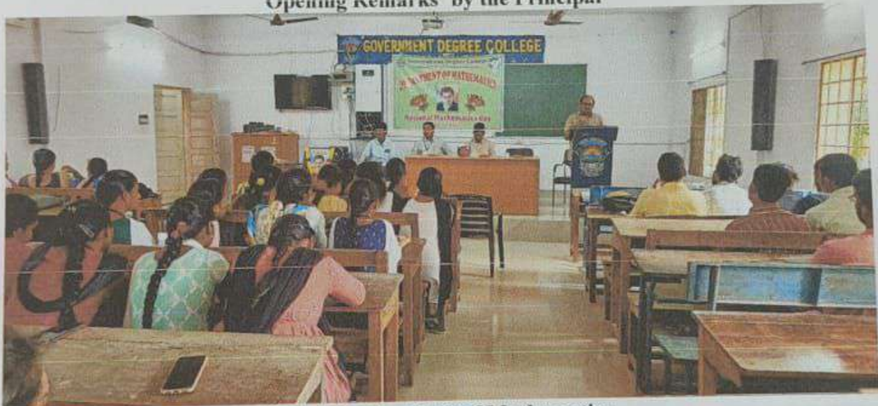
Speech by the HoD of Mathematics